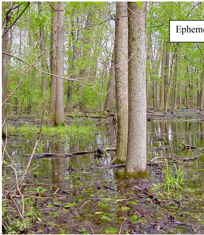
Ephemeral wetlands, spring