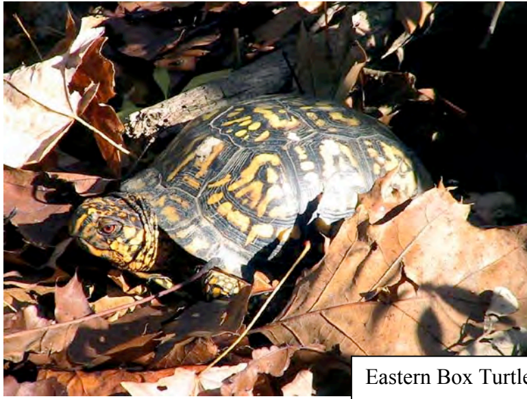
Eastern Box Turtle present in Crown Hill Woods