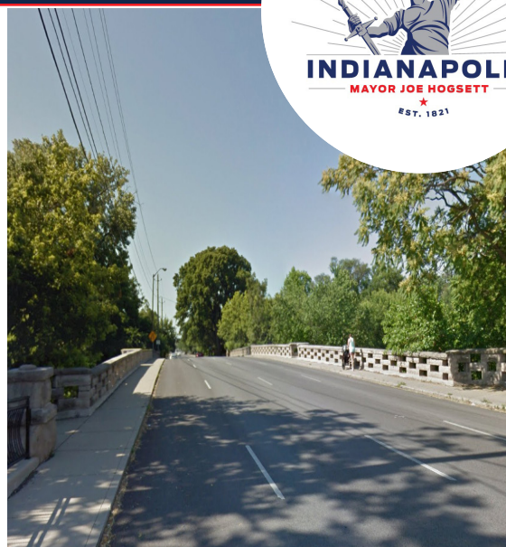
Central Avenue detour and traffic changes, and the Central Avenue bridge